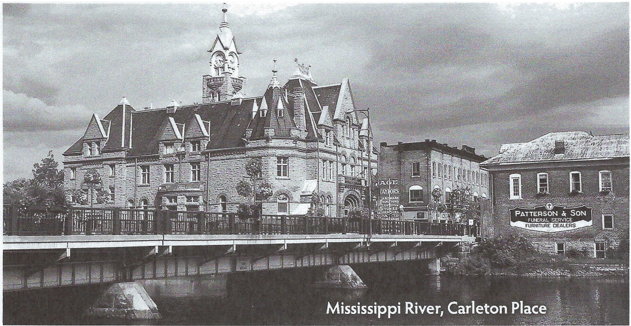
Mississippi River, Carleton Place

Visiting with kids? A great place to let them blow off steam is Riverside Park (175 John Street), where you'll find a beach on the Mississippi River, boat launches, play structures, picnic tables and a splash pad. Put a canoe or kayak in the water here and you'll be following in the wake of a long line of paddlers; the nearby Carleton Place Canoe Club (179 John Street) dates back to 1893 and is the oldest continuously operating such club in Canada.