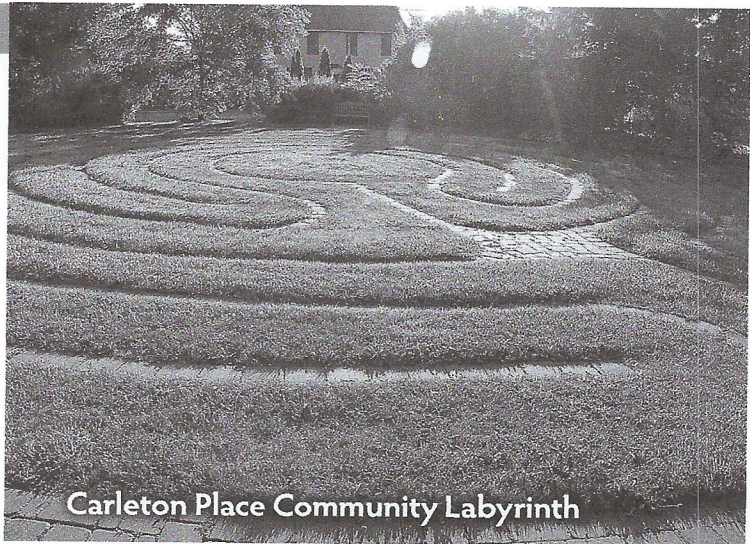
Carleton Place Community Labyrinth

A keen community group built the labyrinth and opened it to the public in 2011. It's open 24 hours a day, free of charge, and occasionally hosts public events.