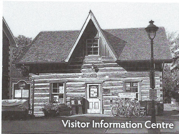
Visitor Information Centre

For more details on visiting Carleton Place, check out the town's website ( carletonplace.ca ) or drop by the aforementioned Visitor Information Centre at 170 Bridge Street. You can't miss it, as it's located inside